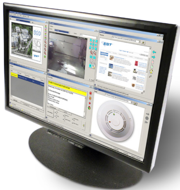
Your compass: EST3's FireWorks Graphical Command Interface.

Anything less is just groping in the dark.